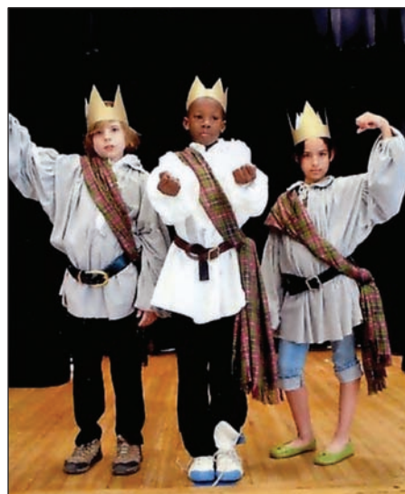
Shakespeare Without Tears at Glennwood