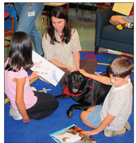
Read to the Dog at Winnona Park