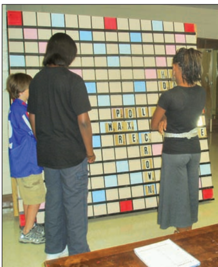
Life-size Scrabble at Renfroe

School/dept.: Winnona Park Elementary To pay fees associated with bringing a trained therapeutic dog to the classroom to which struggling readers can read aloud.